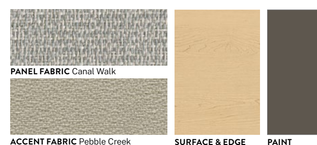
SURFACE & EDGE Hardrock Maple