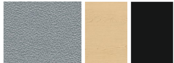
PANEL FABRIC Colonial Downs