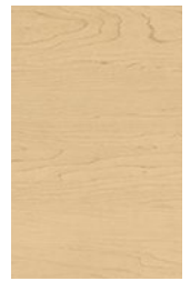
WORK SURFACE Hardrock Maple