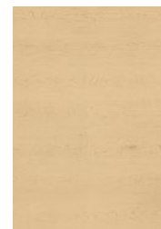
SURFACE Hardrock Maple