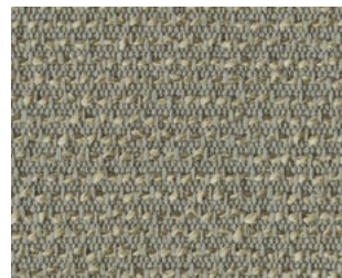
FABRIC Strata Cement