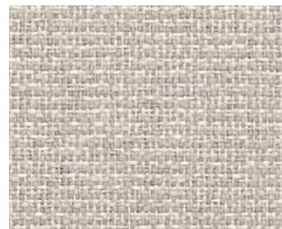
PANEL FABRIC Belmont Silver