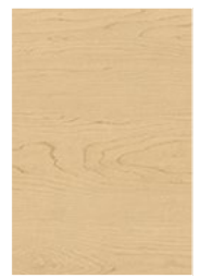
SURFACE Hardrock Maple