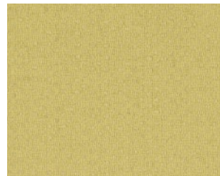
PANEL FABRIC Streetwise Hydrant