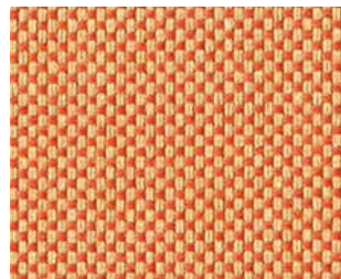
PANEL FABRIC Cape Cod Apricot