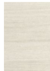
SURFACE & EDGE White Cypress