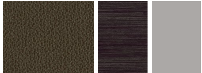
ACCENT FABRIC Anchorage Fossil